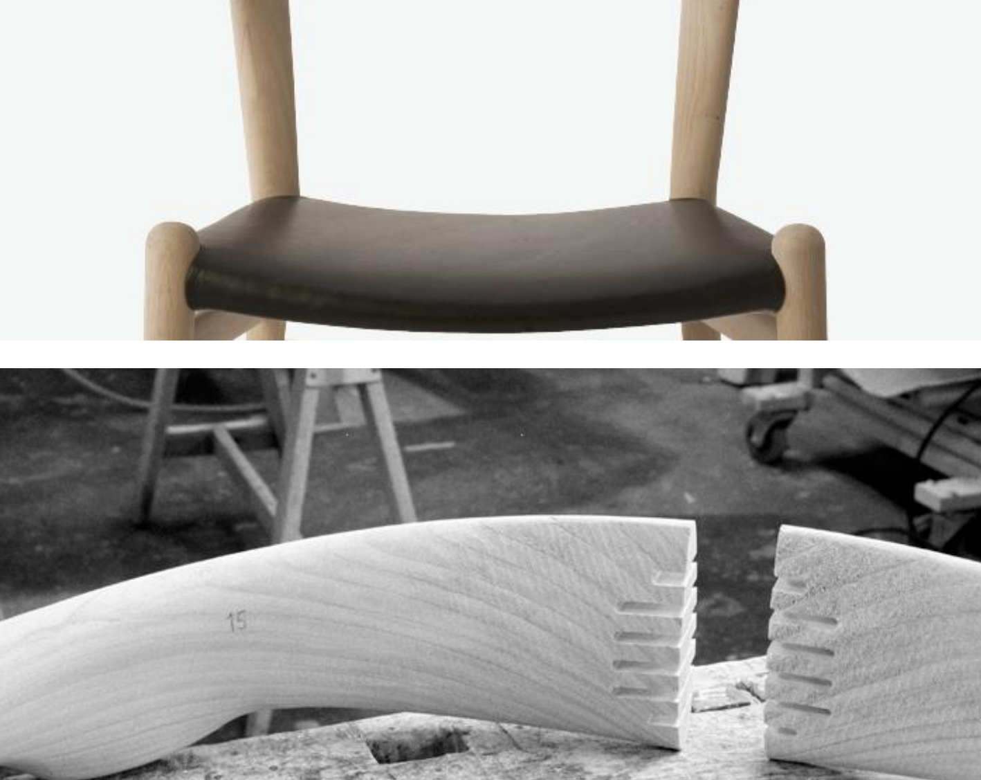
Materials For guidance only. Wood varies in colour and structure.